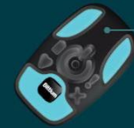
Device (Bittium Faros™)